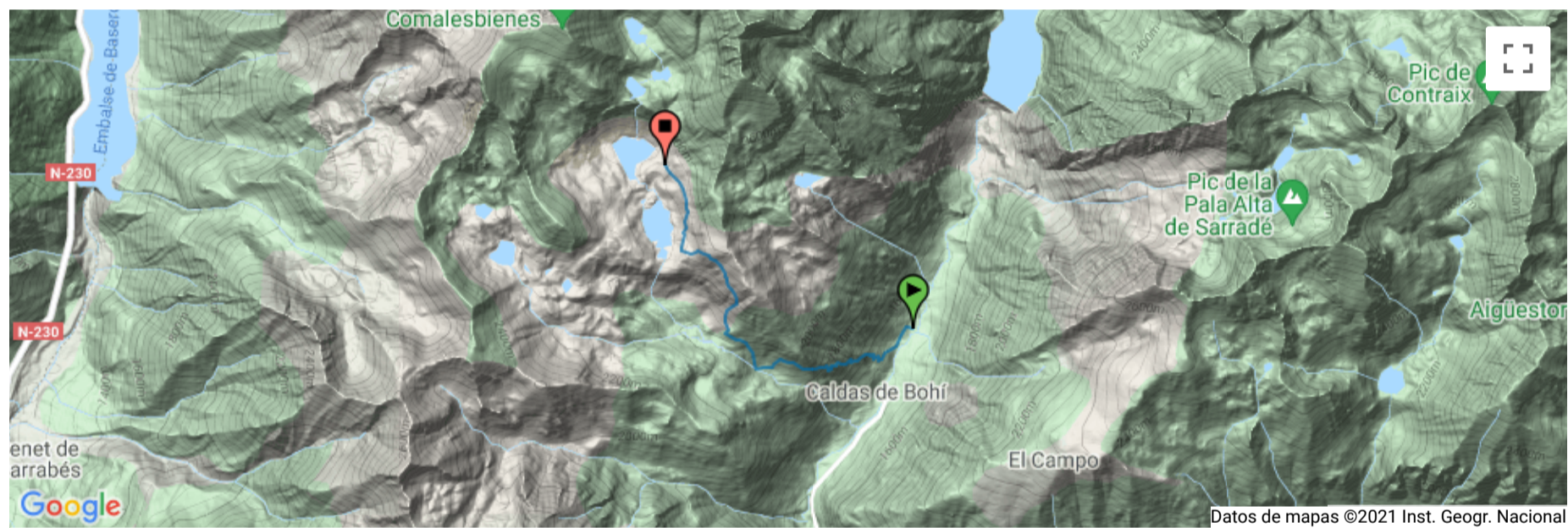
E05_toirigo_estanys G201amena on GPSies.com

Drive along the L-500 road towards Caldes de Boí as far as the car park on the left-hand side after the Toirigo information booth (1.500m). The path to the Gémèna lakes (2.257m) leaves from the car park itself via the Llubriquito plateau.