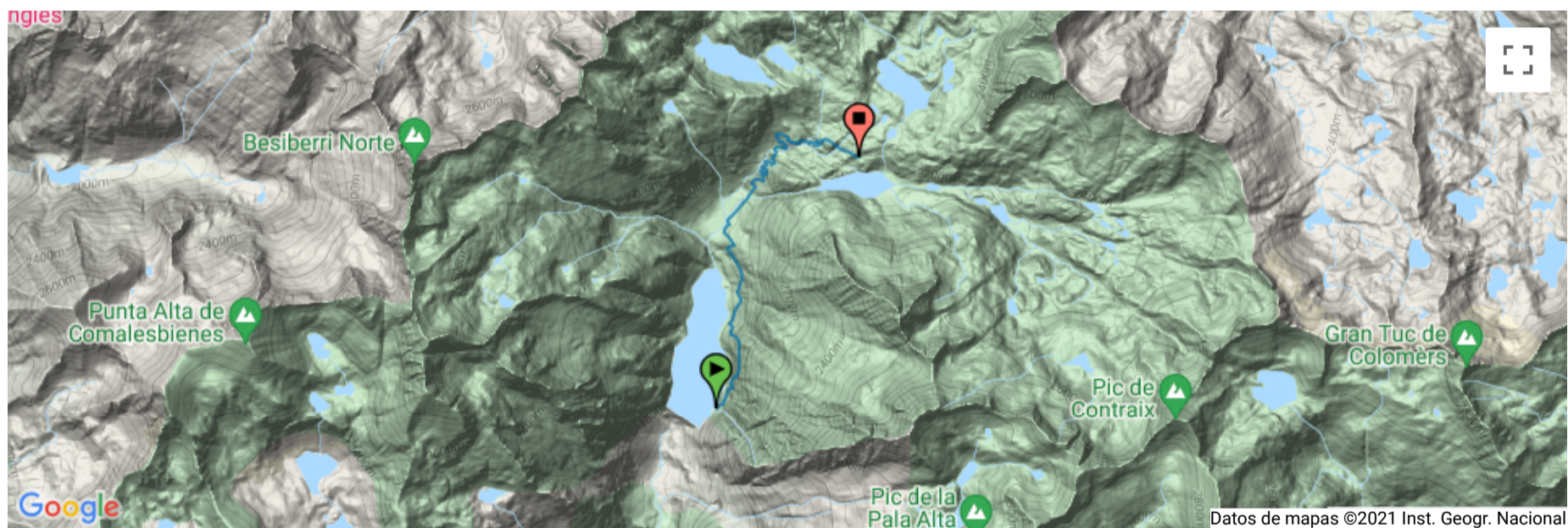
E04_cavallers_estany Negre on GPSies.com

From Boí along the road to Caldes (L-500) up to the parking lot of Cavallers. The itinerary takes us to the upper basin of the Caldes riverside. The livestock that goes to graze at Val d'Aran also uses this route to cross over to Colomers by the Port of Caldes. Once we can see the waters of Cavallers, we take a well kept trail along the edge of the dam, which constitutes a sight varying in beauty according to the time of the year. Once at the end of the reservoir there is a slight climb up to the Plateau of Riumalo. After that comes the steepest ascent, known as Llastres de la Morta (literally "the ballasts of the deceased"). We will then wind along the ice polished rocks until we see Estany Negre right underneath us.